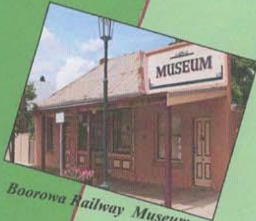
Boorowa Railway Museum